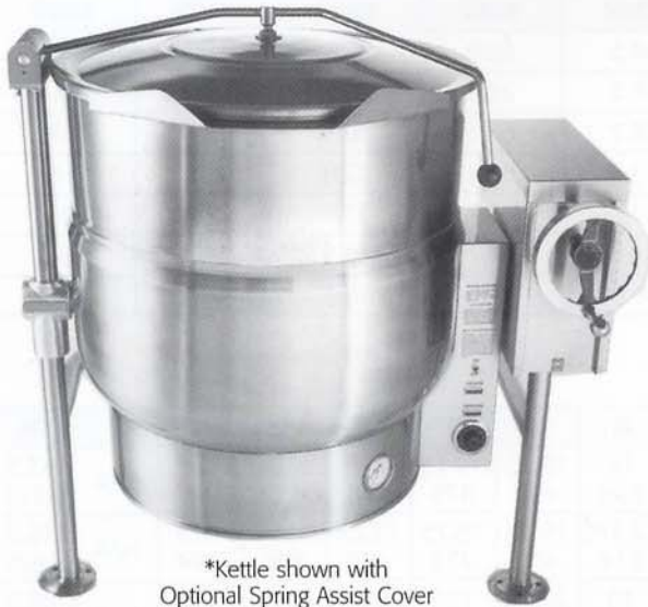
*Kettle shown with Optional Spring Assist Cover