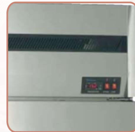
Detail : 2