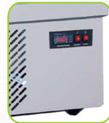
Detail : 2