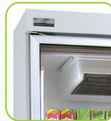
Detail : 1