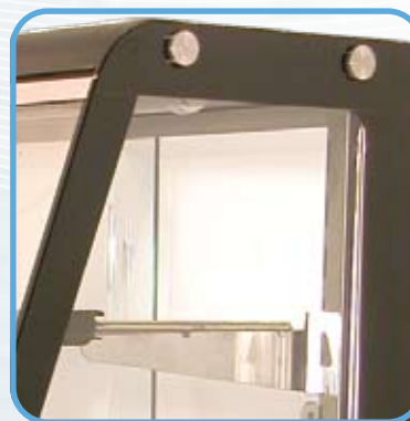
Detail : 1