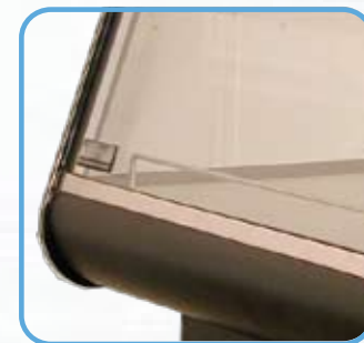
Detail : 4