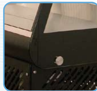
Detail : 2