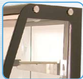
Detail : 1

Elegant counter top drop-in refrigerated display.