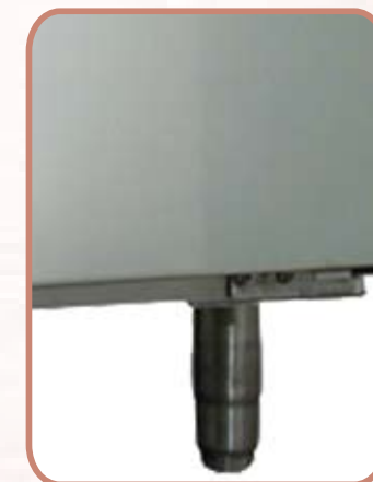
Detail : 2