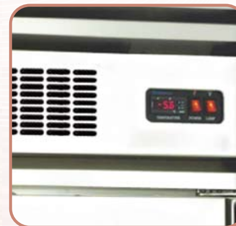
Detail : 1