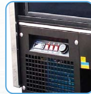
Detail : 2