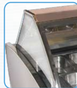
Detail : 2