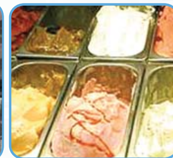
Detail : 4