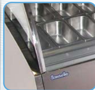
Detail : 1

Striking contemporary, elegant design, blending soft curves with glistening stainless steel.