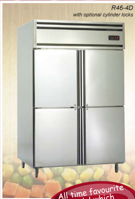
R46-4D with optional cylinder locks

All time favourite model which becomes industry standard.