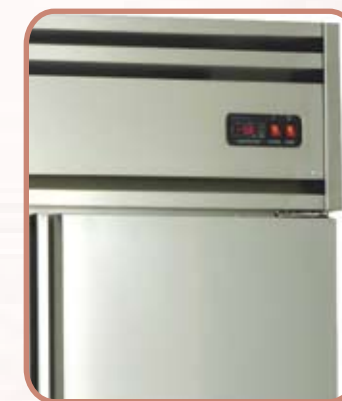
Detail : 2