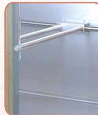
Detail : 1