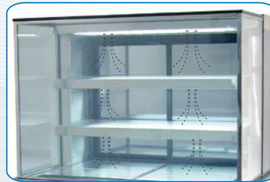
Detail : 1

Contemporary multi-purpose display showcase.