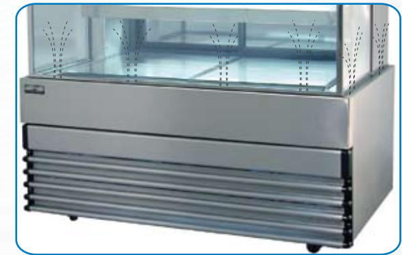
Detail : 2

Unique low velocity air flow designs that cool product without excessive drying, prolonging freshness and shelf life.