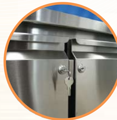
Optional Cylindrical lock

Sanwich preparation unit with flexible configuration.