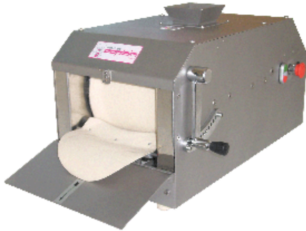
Table top machine